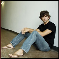
Aaron Shust in concert on October 7.