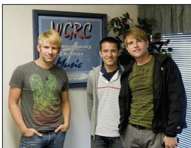
The group 33 Miles visits WGRC