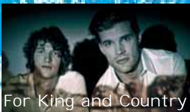
For King and Country