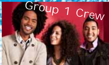
Group 1 Crew